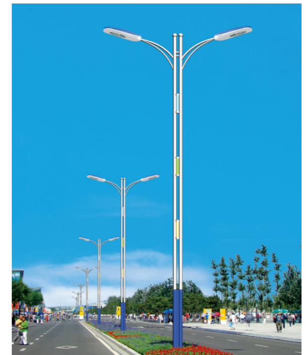
RMLD - 029