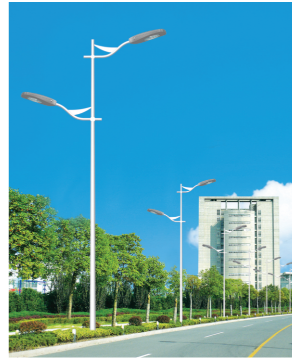
RMLD - 026