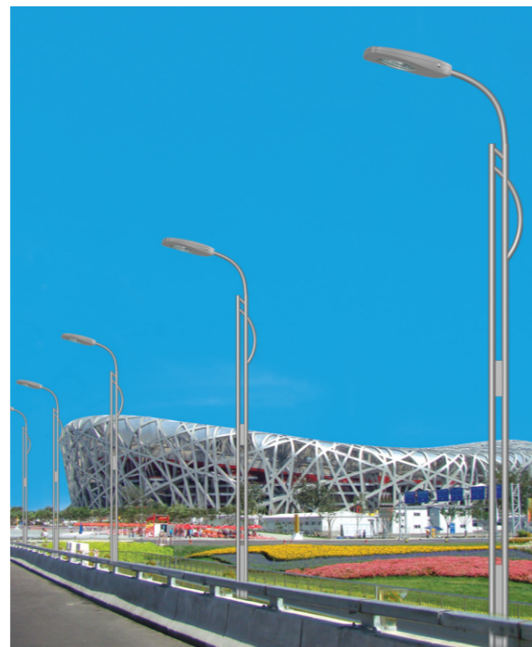
RM LD - 025