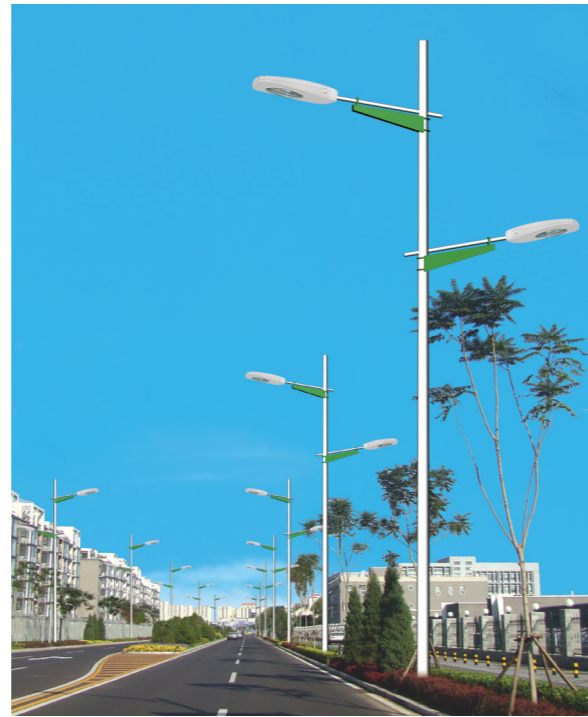
RM LD - 024