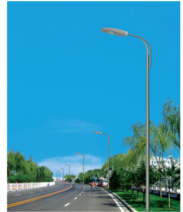
RMLD - 027