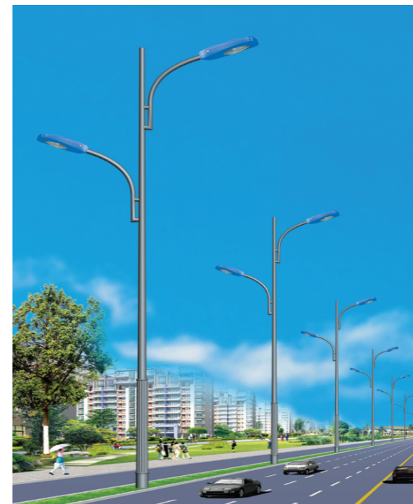
RMLD - 028